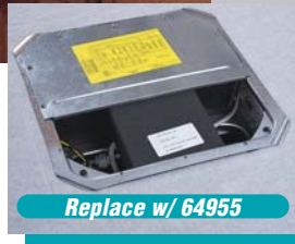
Replace w/ 64955

64955 Chillgrille For 8000 Series Coleman Mach #8330A6331 1