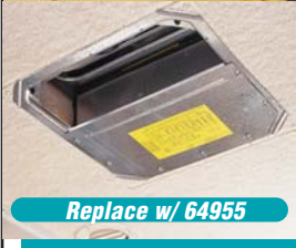
Replace w/ 64955